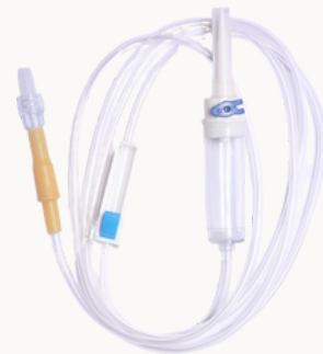
PREMIUM IV SET