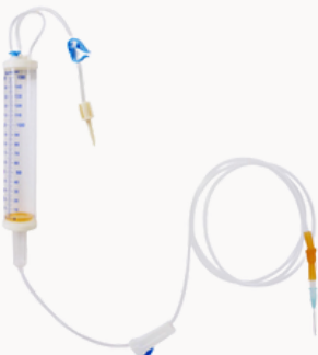
MEASURE VOLUME SET