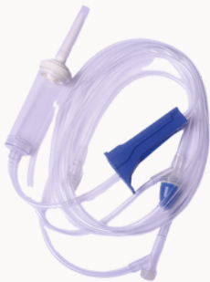
NEEDLE FREE IV SET